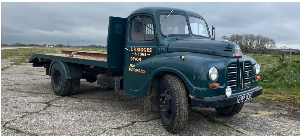
Austin Loadstar flatbed diesel lorry. Synchro gearbox. Reg. PWR 936