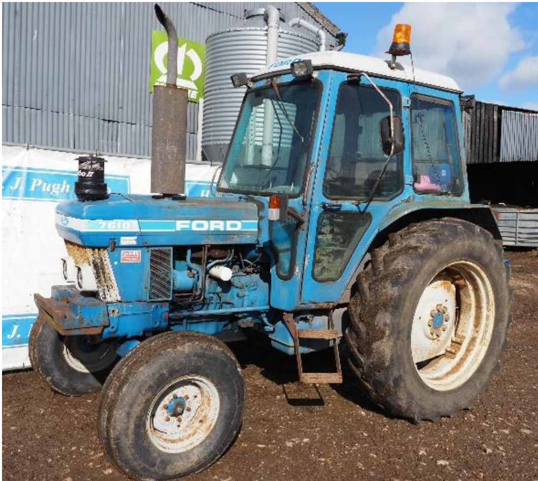
Ford 7610 tractor. Gears on floor, dual power, showing 11,000 hours. Reg. B726 BMR