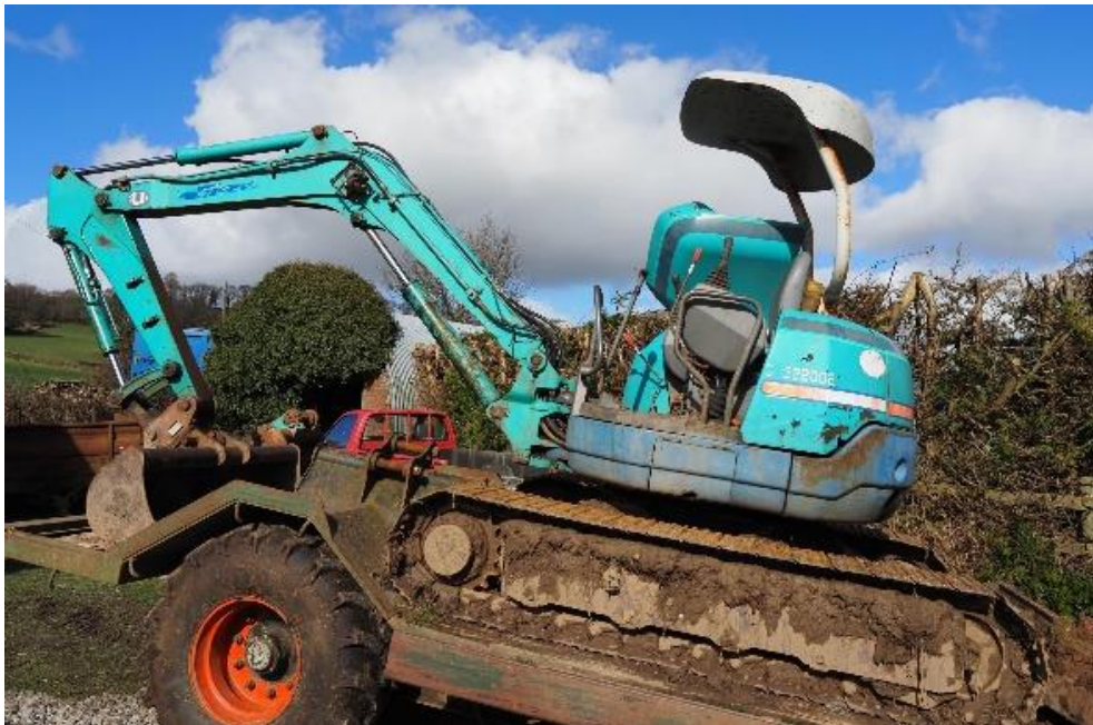
Kubota U-45 digger on steel tracks. C/w 4 buckets