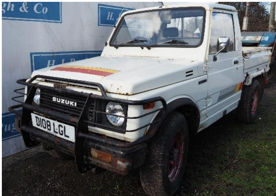
Suzuki SJ410 4wd petrol truck. Runs. Reg. D108 LGL

** The following lots have been included with permission **