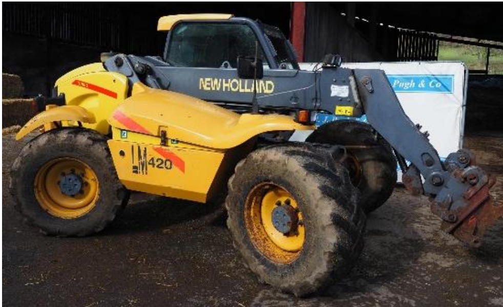
New Holland LM420 loader. Showing 3000 hours. Reg. X542 BOD