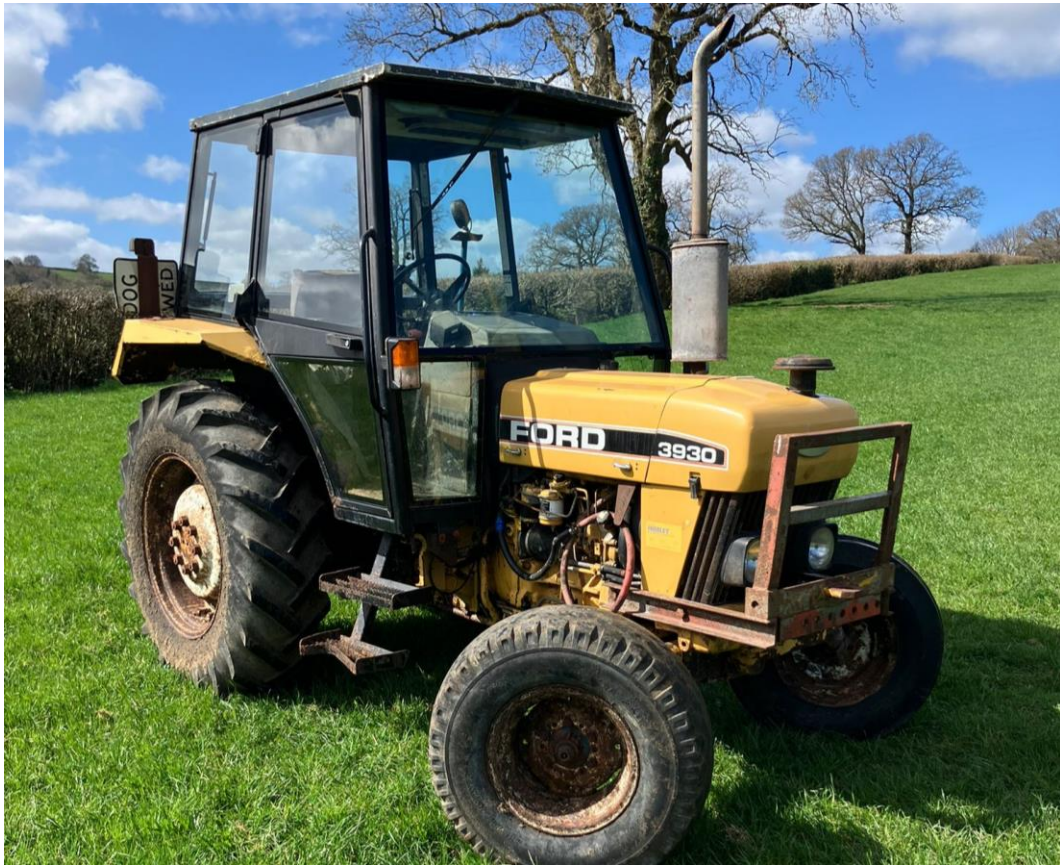
Ford 3930 scraper tractor. Showing 6758 hours. Reg. K578 PAB