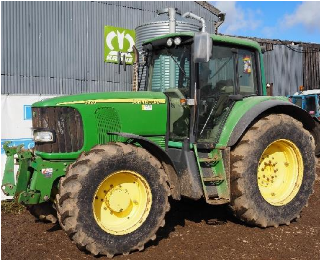
John Deere 6920 tractor.

40k. C/w front linkage. Showing 8400 hours. Reg. FX04 KTL