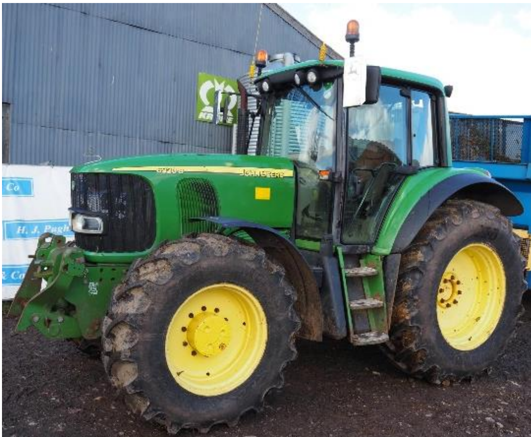
John Deere 6920S tractor.

40k. C/w front linkage, showing 11,000 hours. Reg. HJ02 XDZ